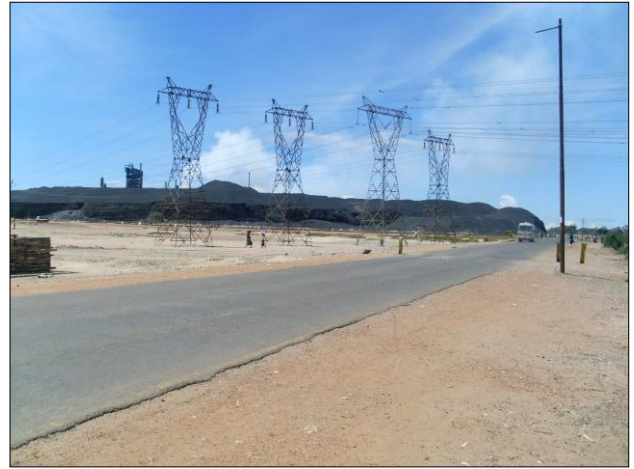
The area of slag heaps in Kankoyo to the west to the smelter, Mufulira, Zambia

Meeting the 15 children, aged between 14 and 16 years of age, I am able to explain that Mufulira is not a town that happens to have a copper smelter but is the very reason for its existence. Together we looked at photos which illustrated both how lush Zambia can be, but also, sadly, at times, how polluted. The theme of this year's visit is the environmental impact of the mine and smelter - an educational and scientific topic that ties in with the UN Millennium Development Goals - reducing poverty and hunger, ensuring children complete primary education, ensuring environmental sustainability and developing global partnerships.