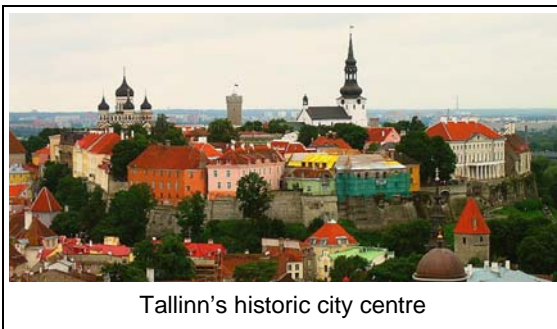
Tallinn's historic city centre