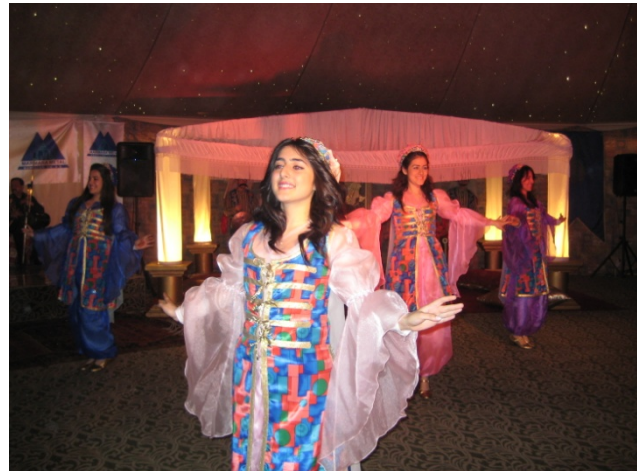
.. and the harem girls' welcome