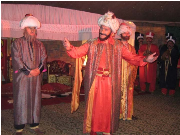
The sultan's welcome...