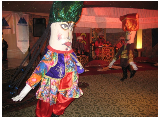
Traditional dancing #2